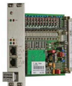
DS-6 Analog Interface Module

The DS-6 Backplane is designed for four analog DS-6 interface modules and contains four USB interfaces.